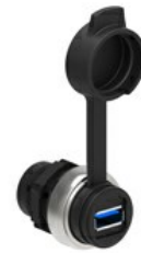
USB interface, A/A female type connection LPCD0